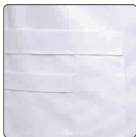
double patch pocket